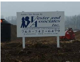
The construction of the infrastructure is complete.